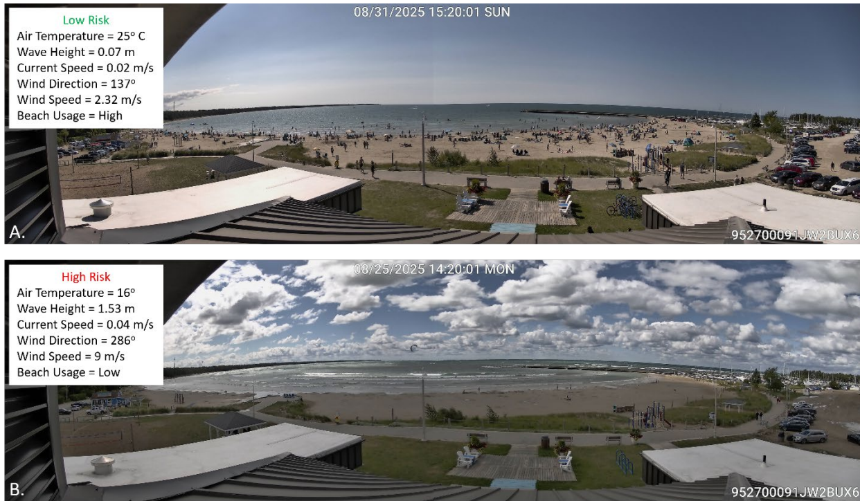
Figure 3: Camera images taken during Labor Day weekend (A.) and during a week day in August (B.) when hazard levels were low and high, respectively.

Imagery allows for the monitoring of beach user behaviour in response to lake conditions being recorded by the wave buoy. This is particularly important because previous surveys conducted by Smart Beach found that the majority of people commuting from outside of the local area did not to check weather or lake conditions prior to traveling to the beach. In other words, there may be an influx of people on the beach when lake conditions are unsafe due to advanced travel plans. Initial results of imagery at Port Elgin reveal that beach usage tends to increase during good weather conditions, weekends, and extended bank holiday weekends (Fig. 3A.). Alternatively, cooler days with higher winds and surf tended to have the fewest people on the beach (Fig. 3B.). While these results are expected, further analysis is needed to determine if there are instances when beach user behaviour did not align with surf zone hazards and, in case, how to better communicate potential risks to the public. Over the next two years, imagery will also provide valuable field-based evidence on the efficacy of the beach warning application to alter behaviour and need for improvements.