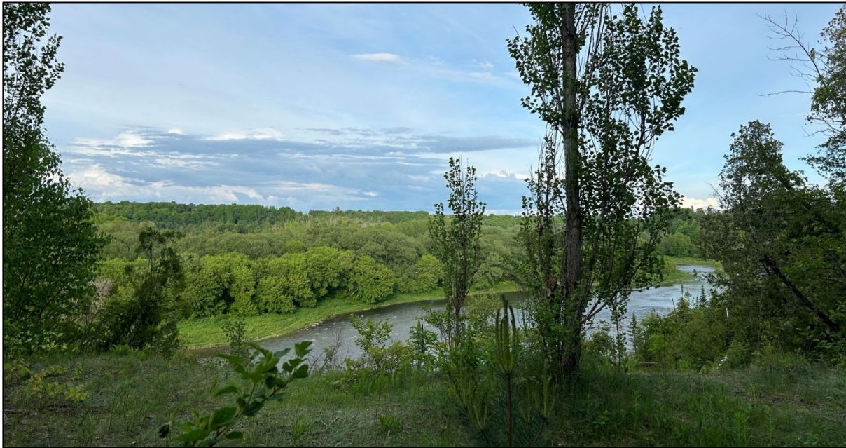
Figure 4 - View of Saugeen River (DH 2024)

The Saugeen River ( Figure 4 ) continues to hold value to the community as a defining natural feature of the area and facilitates recreational activities including canoeing, kayaking and fishing.