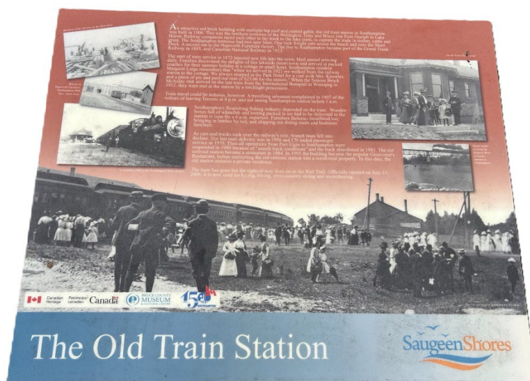
Figure 7 - Saugeen Shores Commemorative Plaque for the Old Train Station in Southampton (DH 2024)

The railway transported various farm goods, local industry products, fish and timber. It also provided a boost to tourism in the area as a more convenient method of travel for residents and cottagers eager to visit resort towns. William Knowles bought a tract of land on the lakefront land bounded by Morpeth, Huron and Chantry View (the "Knowles Block") and in 1888 opened the Park Hotel at the foot of Morpeth Street. Port Elgin became a tourist destination in the 1880s, with passenger boats primarily from America visiting this area. The number of dwellings and buildings and growth of industries and institutions bears witness to the impact of the train service on Southampton and Port Elgin. This growth was not without interruption. Southampton suffered the Great Fire of 1886 when a building caught fire in the early morning. The high winds fed the flames, which destroyed 50 buildings on the north side of High Street and threatened buildings along Grosvenor Street. Cultural heritage resources associated with the period of growth after the arrival of the railway include: