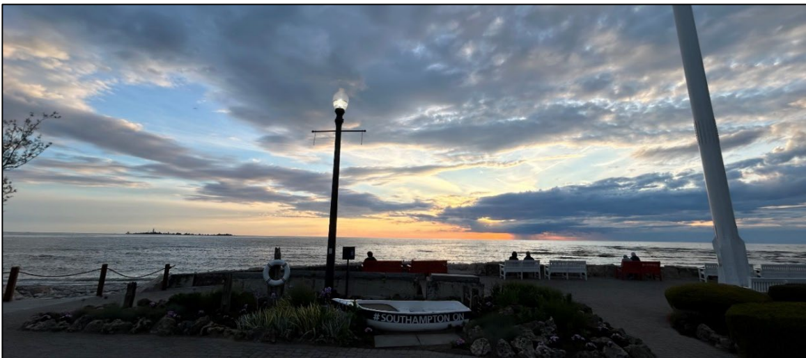
Figure 3 - Southampton Waterfront Sunset, Chantry Island visible in background at left

The community has commemorated lives lost on the lake through plaques and recognition of dwellings associated with families sustained by the fishing industry. Marine history and ties to the fishing industry still forms part of the community's collective memory. The following cultural heritage resources are associated with the marine history and fishing industry in the area: