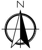
Figure 2: Conceptual Plan for Severed Lot